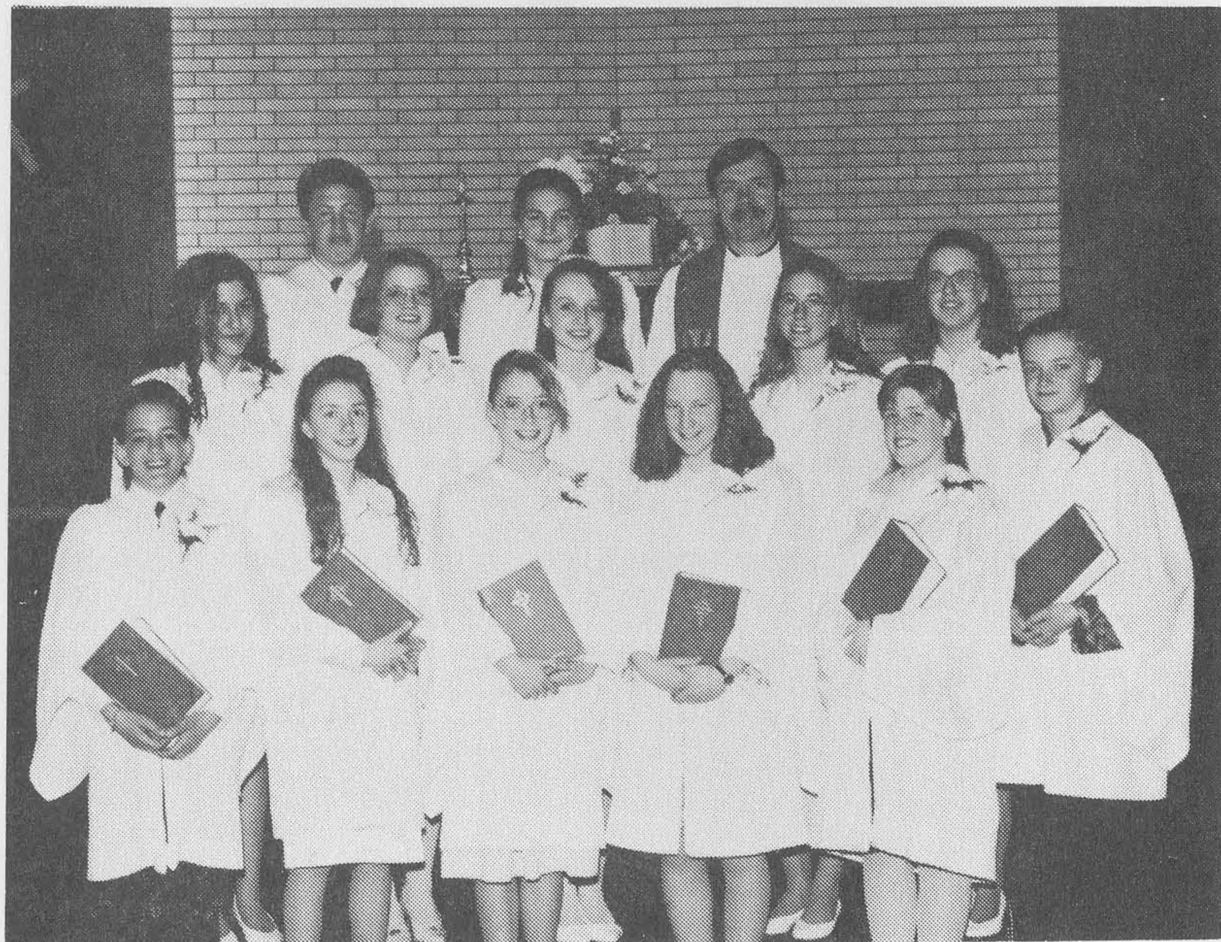
Confirmation Class 1993